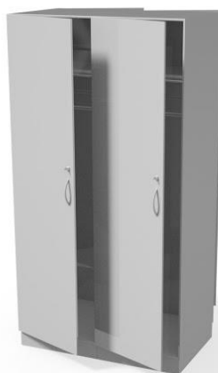
pass-through cabinet WM3103