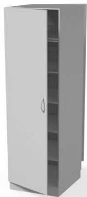
pass-through cabinet WM3100P