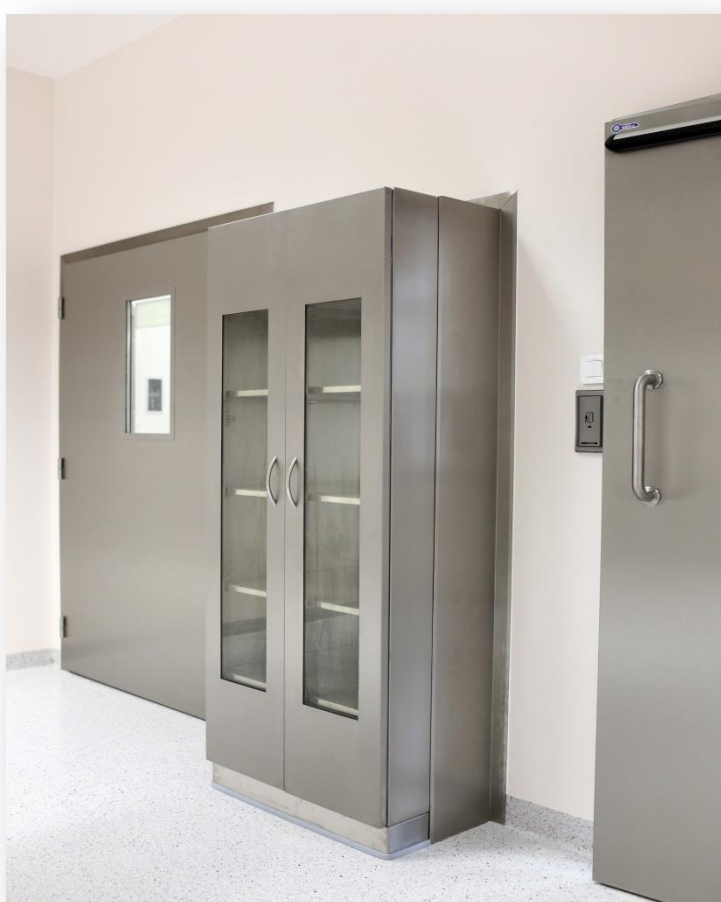
pass-through cabinet WM3112P