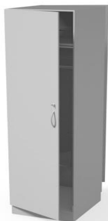
pass-through cabinet WM3102P