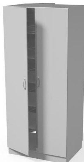
pass-through cabinet WM3107P