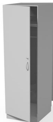
glazed pass-through cabinet WM3101P