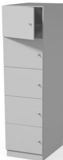
Deposit cabinet WM3104P