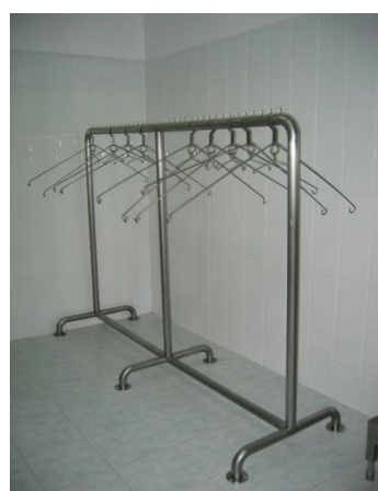
aprons dryer 6004