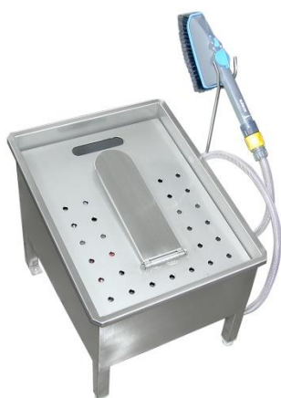
boots washer 6001

Boots and aprons are suitable for cleaning and disinfection of all kinds of shoe soles- low and high, and aprons in a maximum security prison sanitation. They are made entirely of stainless steel 1.4301