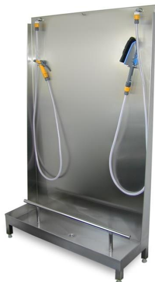
boots and aprons washer 6003