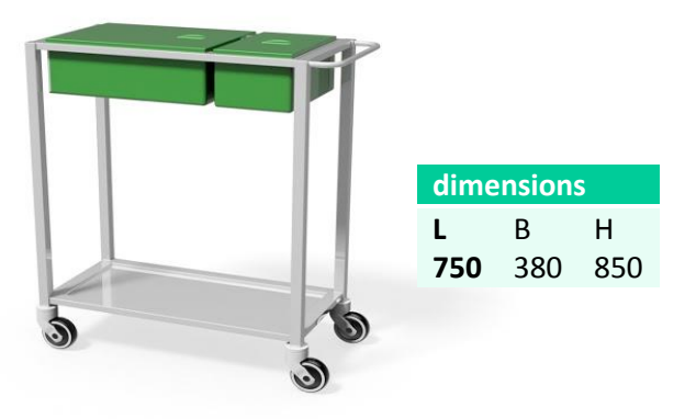
cart for transporting medical materials and surgical tools WM4008

double cart for surgical instruments with hydraulic height adjustment WM1102